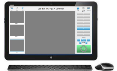
Dell 18-inch Tablet Control System